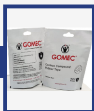
Cable joining kit